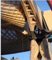
Ribbed-Shell Roof Structure at EXPO 2000, Hanover, Germany

A revolution is stirring within the construction industry. Wood is becoming recognized as a highly attractive structural material for large-scale building projects throughout the world. Fueled by innovations in processing technology and computer aided manufacturing (CAM), contemporary uses of wood demonstrate ingenuity and new direction. Wood is currently a prominent material used in showcase projects at world exhibitions and it is the material of choice in award winning environmentally "green" structures throughout North America.